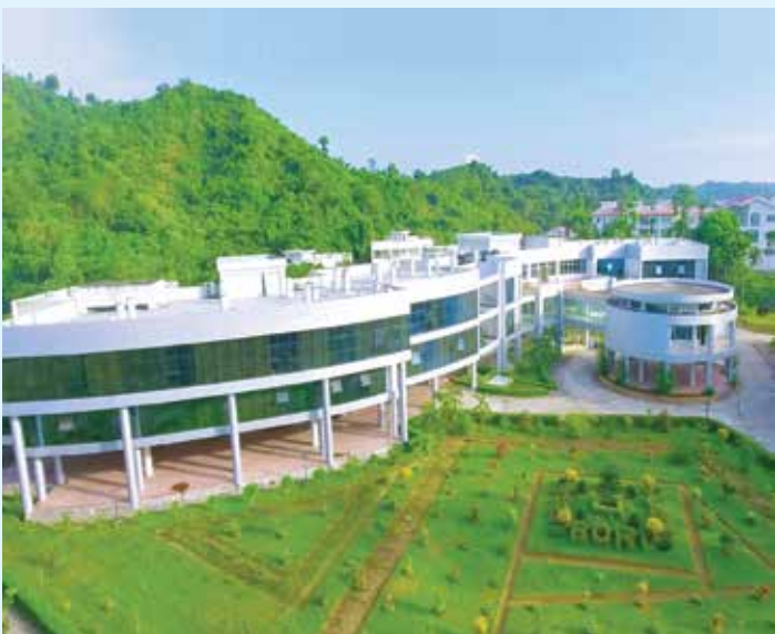
Bangladesh Oceanographic Research Institute (BORI)