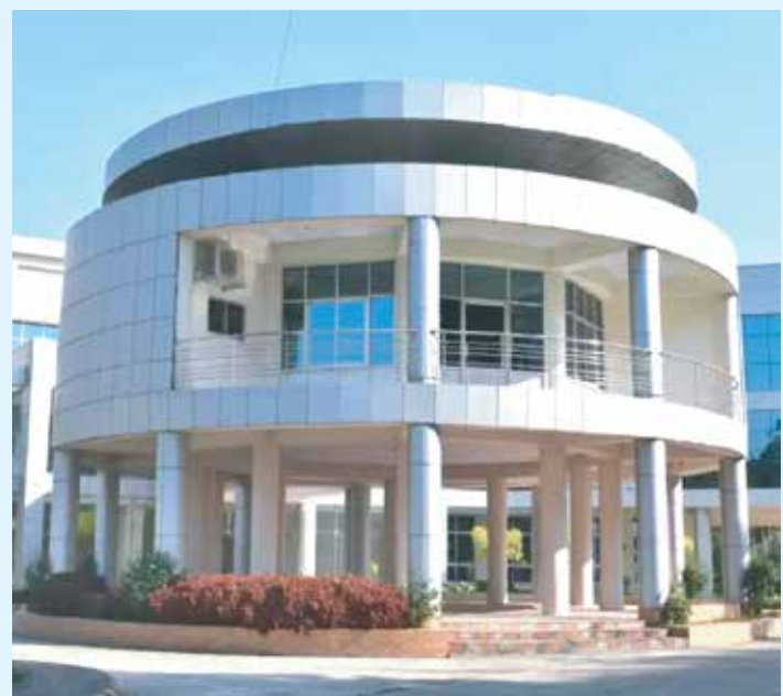
Round Conference Room of BORI